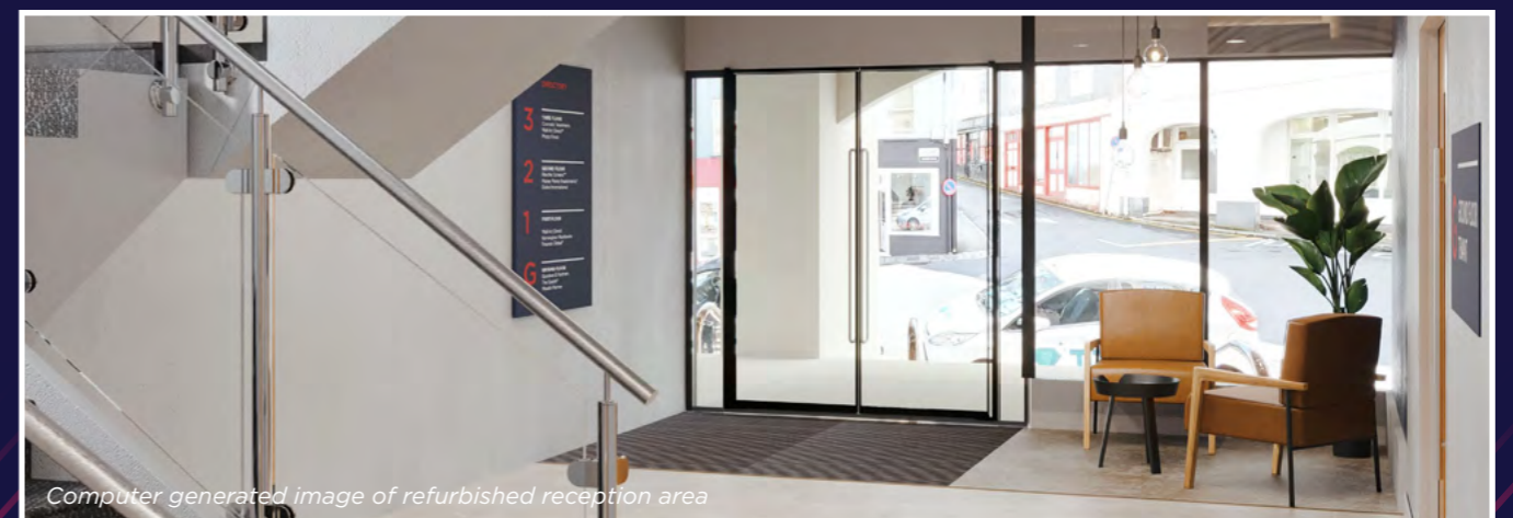
Computer generated image of refurbished reception area