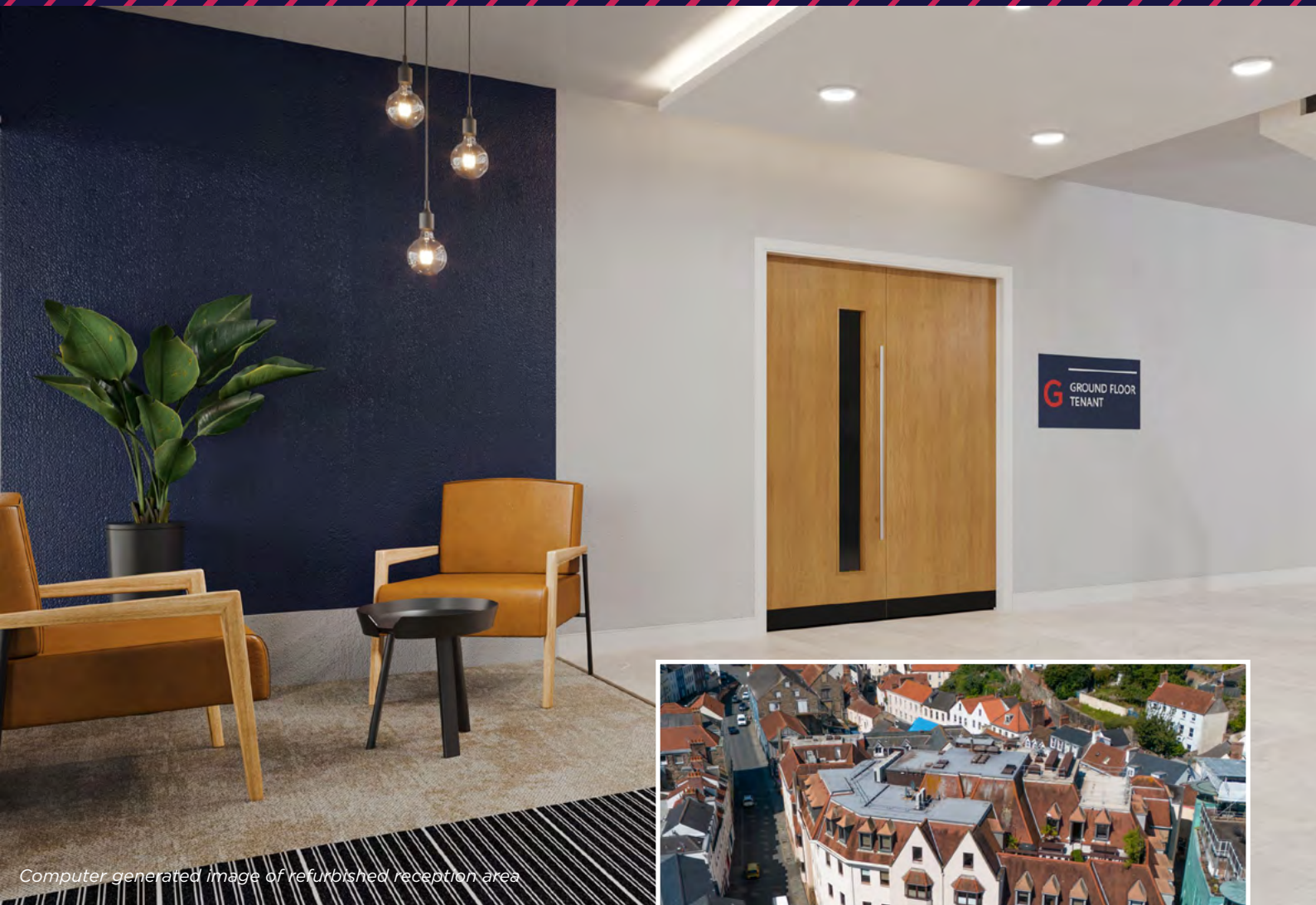
Computer generated image of refurbished reception area