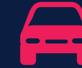
Secure Underground Parking