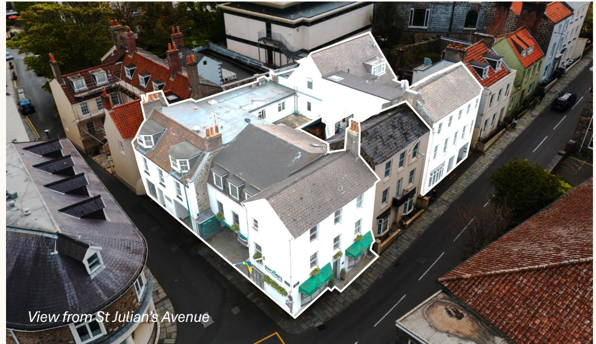
View from St Julian's Avenue