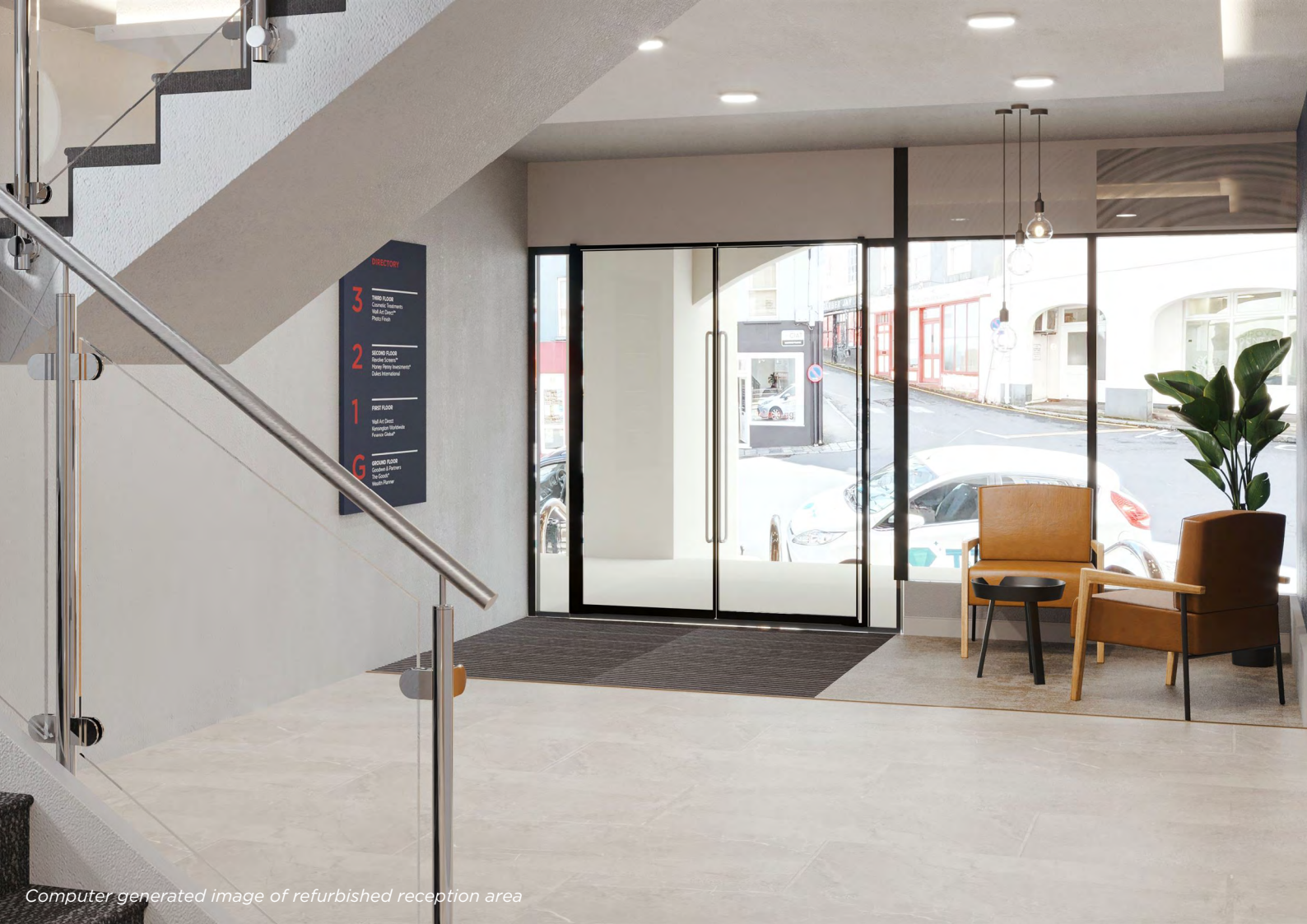
Computer generated image of refurbished reception area